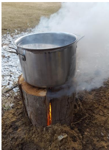
Boiling sap on a burning stump

Businesses start small with big dreams and grow.