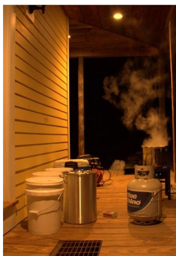
Then to a gas burner on the porch