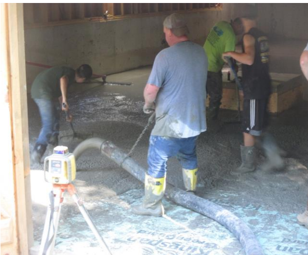
Spread and leveled to create a finished floor.