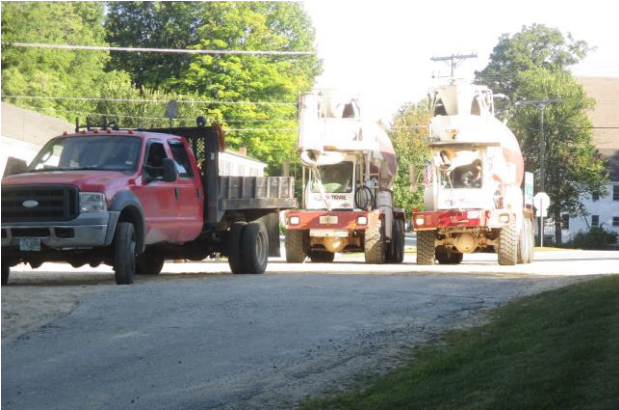
Truck loads of concrete.