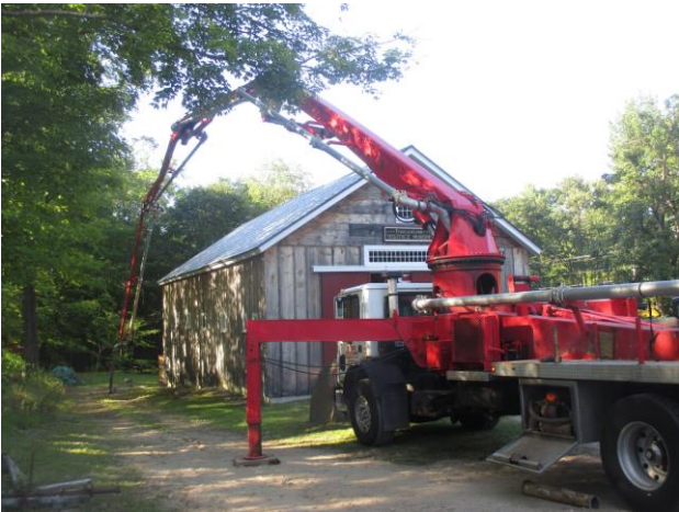
All of which had to be pumped around the building to the rear entry.